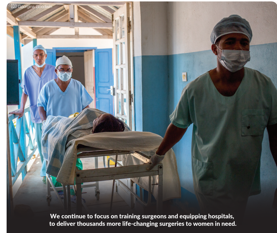
We continue to focus on training surgeons and equipping hospitals, to deliver thousands more life-changing surgeries to women in need.