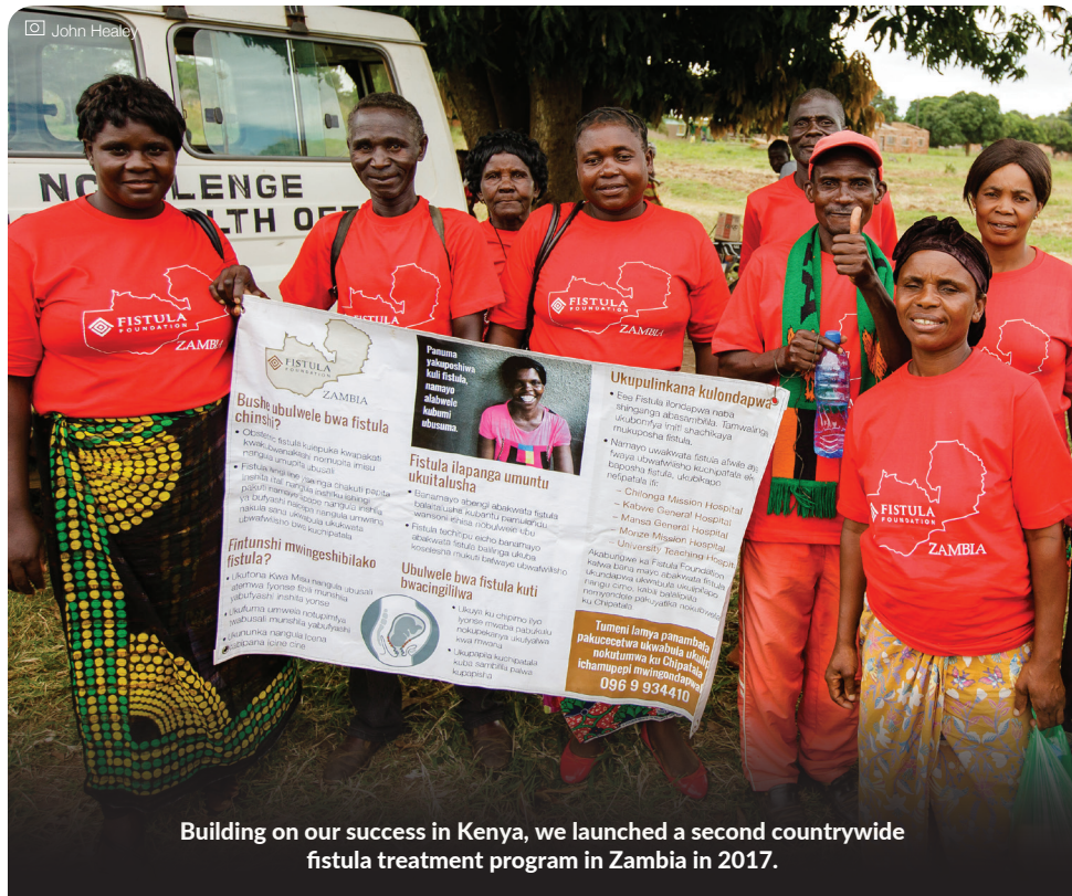
Building on our success in Kenya, we launched a second countrywide fistula treatment program in Zambia in 2017.