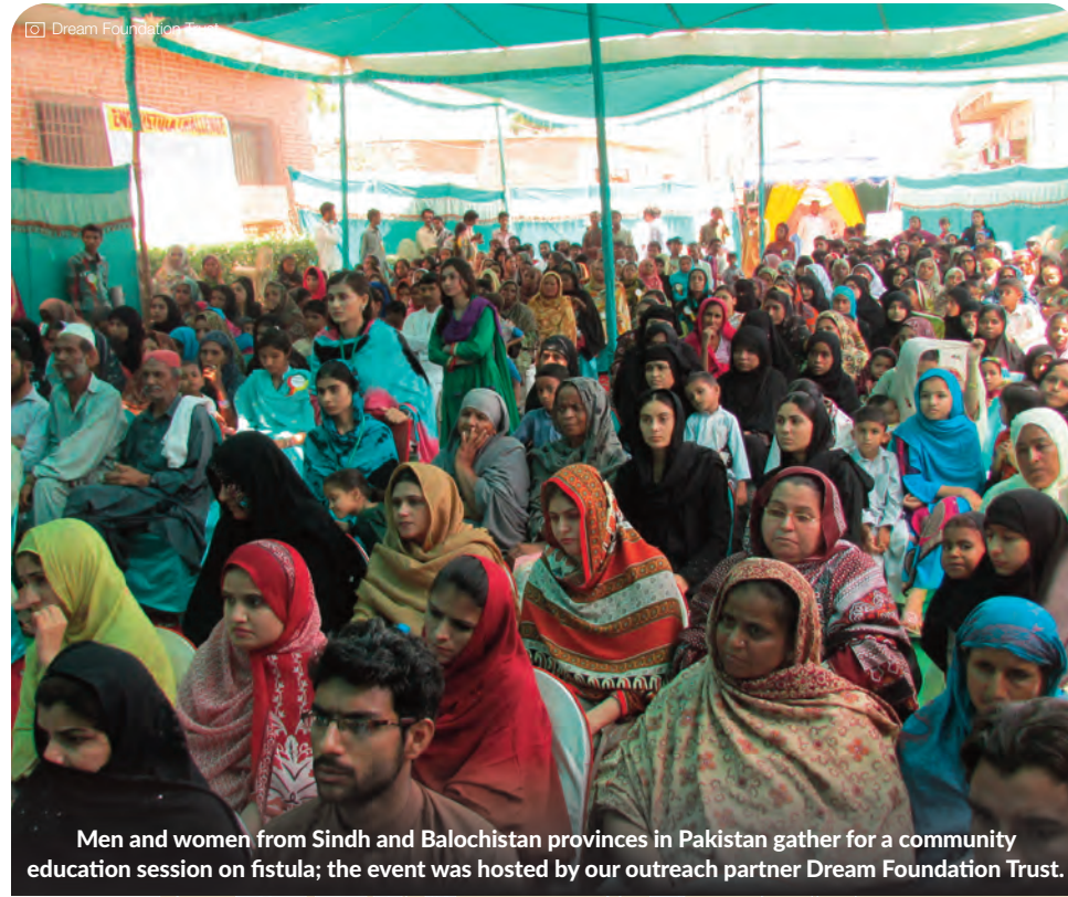
Men and women from Sindh and Balochistan provinces in Pakistan gather for a community education session on fistula; the event was hosted by our outreach partner Dream Foundation Trust.