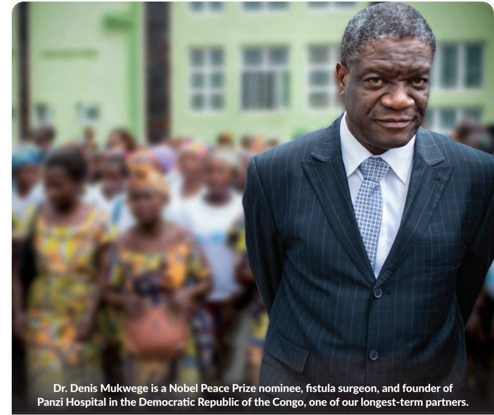
Dr. Denis Mukwege is a Nobel Peace Prize nominee, fistula surgeon, and founder of Panzi Hospital in the Democratic Republic of the Congo, one of our longest-term partners.