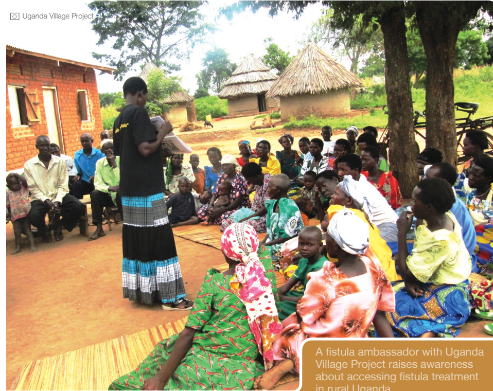
Uganda Village Project